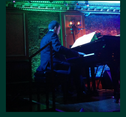
FEAT. BROADWAY PIANIST JUSTIN HORNBACK (MEAN GIRLS, THE PROM, KINKY BOOTS...)