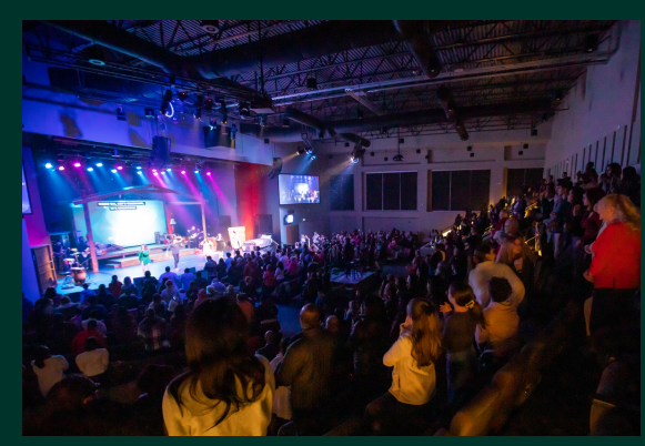
ONE OF OUR AT CAPACITY SIX SHOWS IN OUR STATE-OF-THE-ART AUDITORIUM (SEATS 700)